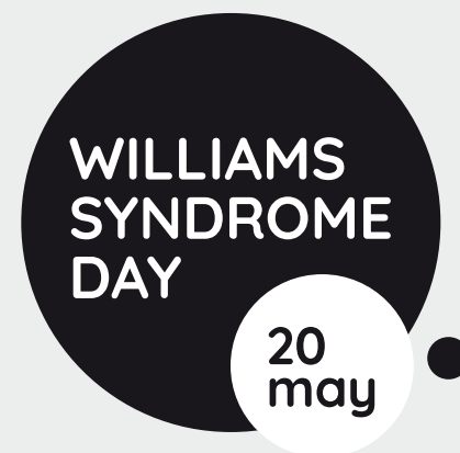
BLACK AND WHITE Use only if you cannot use the colour version.