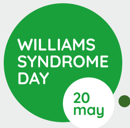
OFFICIAL LOGO To be used in priority