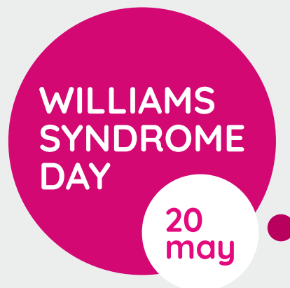
OFFICIAL LOGO To be used in priority